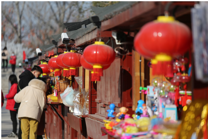
Kaifeng Temple Fair 001