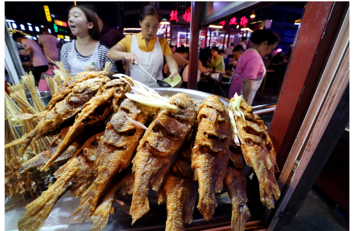
Delicious Fried fish braised with soy sauce