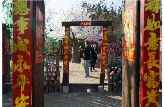
Kaifeng Temple Fair 004