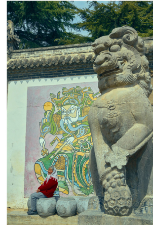
Woodblock printing is popular in Zhuxian Town