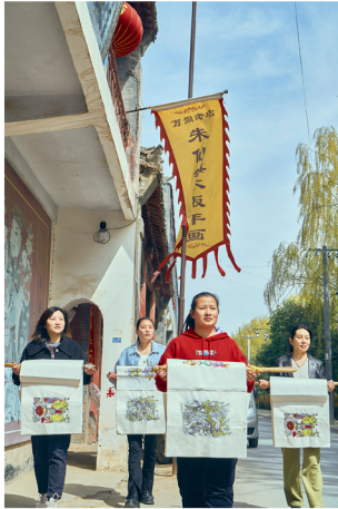
Drying the paint before packing