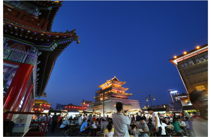
Night Market at the Drum Tower