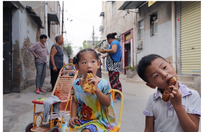
Two Kids having breakfast