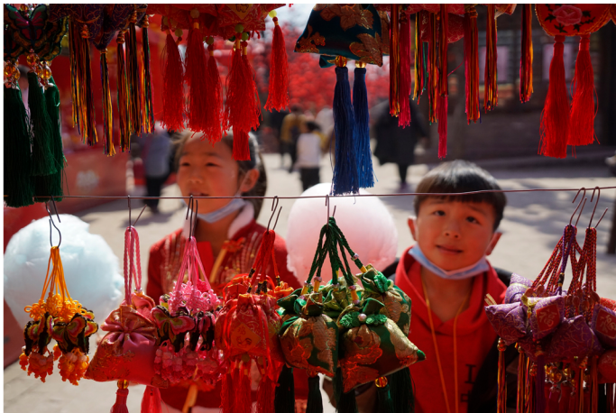
Kaifeng Temple Fair 009