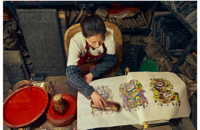
The Lunar New Year Painting in production