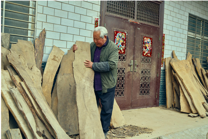
Wooden board selection is an important part of making New Year's paintings