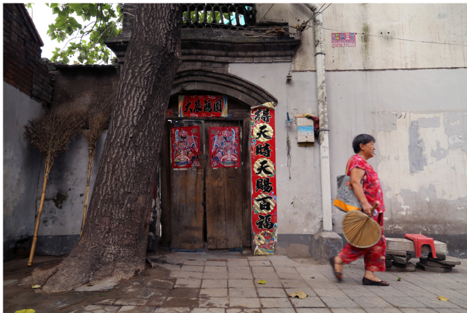
The Traditional style of the gate