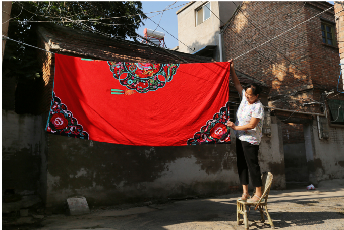
Lady Hanging the Bed sheet