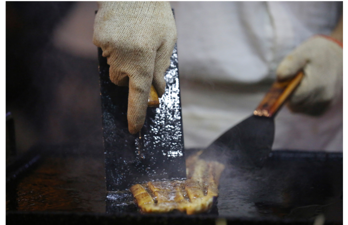
Teppan Grilled Fish