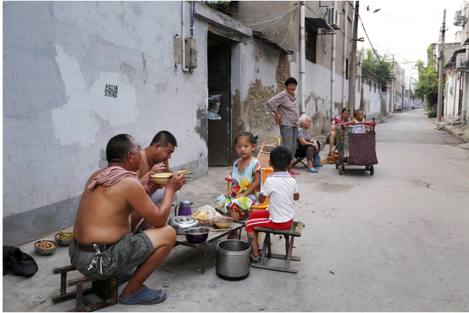
Breakfast in the Alley