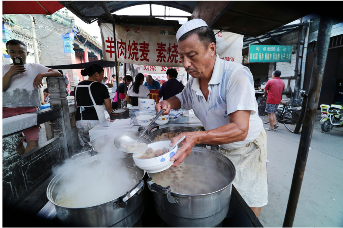
The Busy Chef