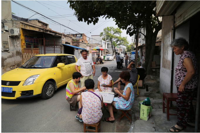
The Residents are playing poker