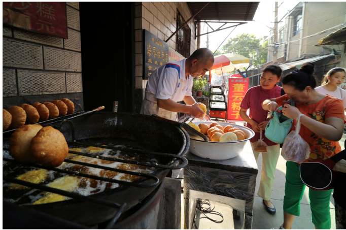
Chinese Sugar Donuts