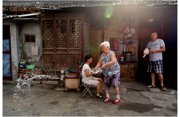
Family on the Old Street