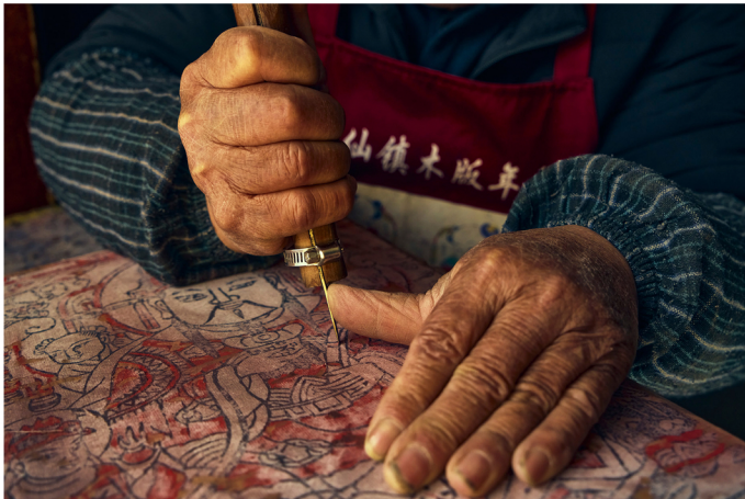
Line carving, which is concerned with the slight inclination of the blade