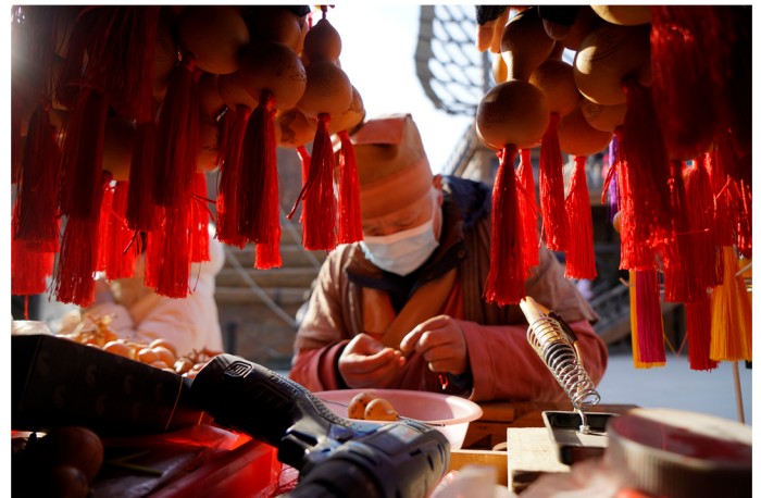
Kaifeng Temple Fair 002