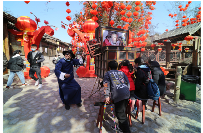
Kaifeng Temple Fair 008