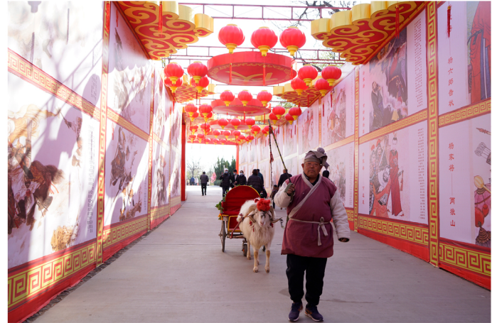
Kaifeng Temple Fair 006