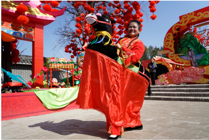
Kaifeng Temple Fair 007