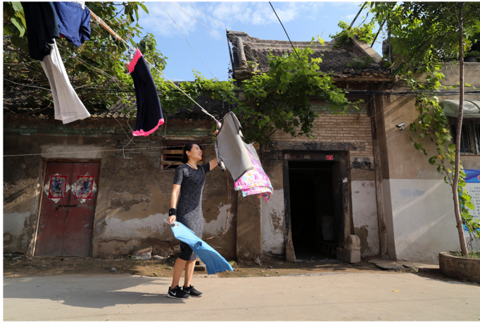
Clothes Hanging in the Traditional Siheyuan