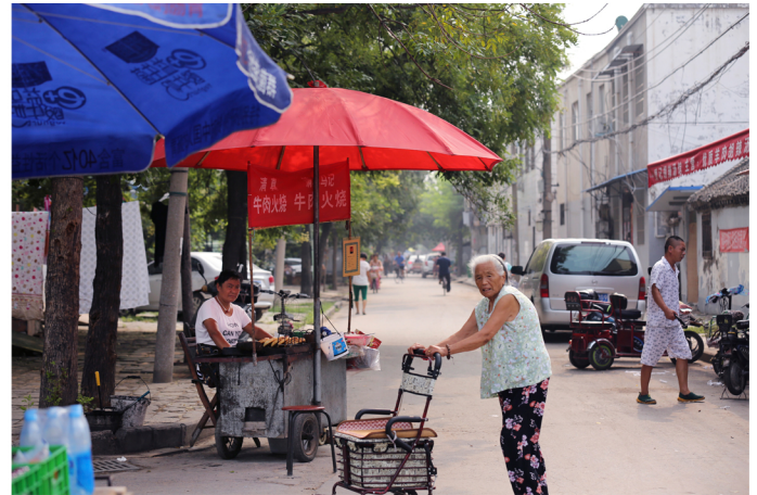
The Senior with her Cart