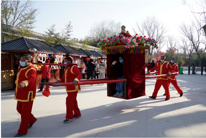
Kaifeng Temple Fair 003