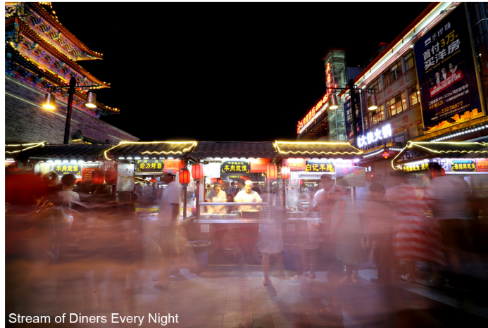
Stream of Diners Every Night