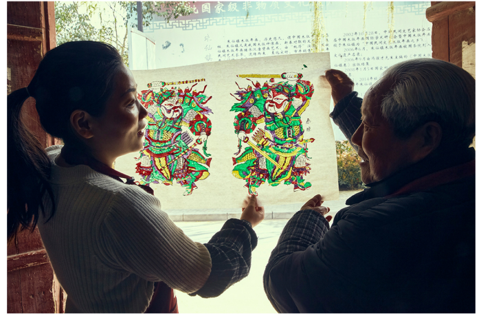
The Grandpa is proud of her Grand-daughter's work