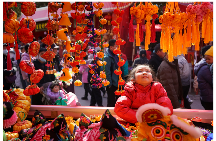
Kaifeng Temple Fair 010