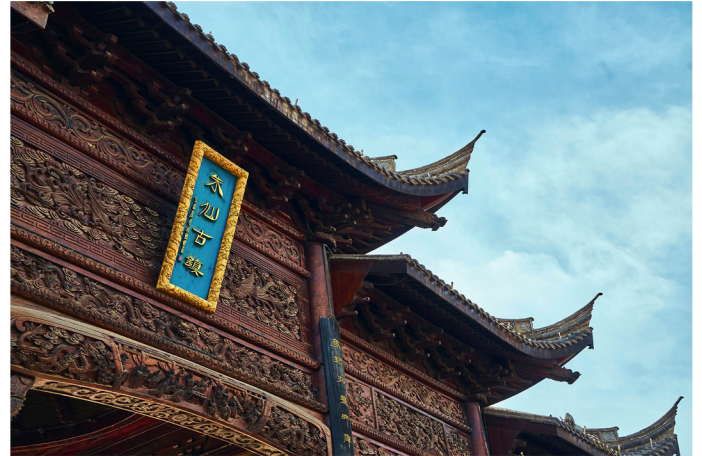
Zhuxian town is known as one of the four great towns in Ming and Qing dynasties