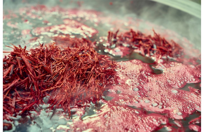
Natural pigments extracted from plants have strong colours