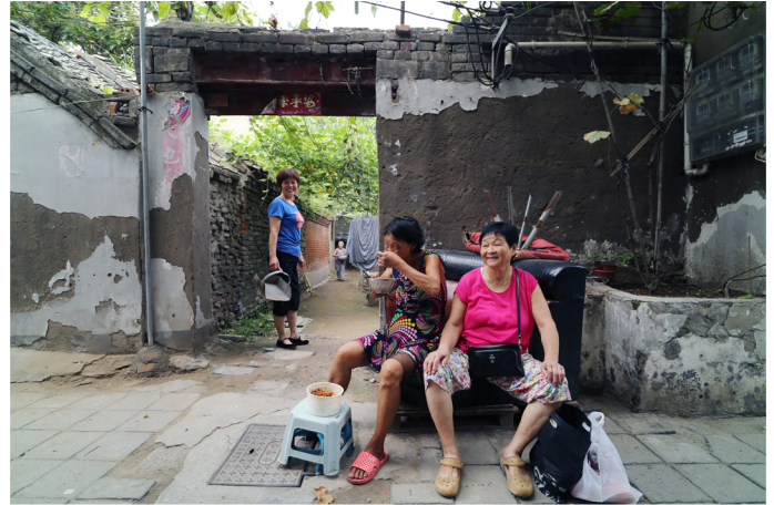
Chatting while having breakfast