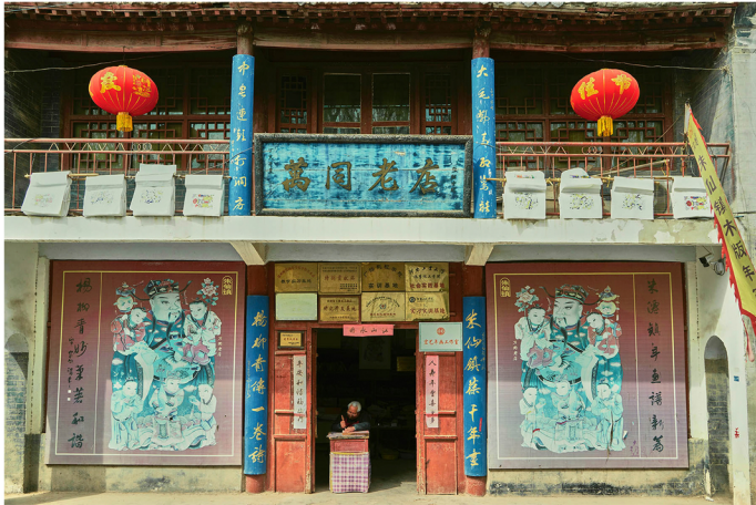
Wantong New Year's Paintings Shop in Zhuxian Town