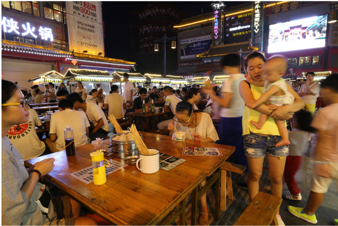
Joyful time of the Young and Old