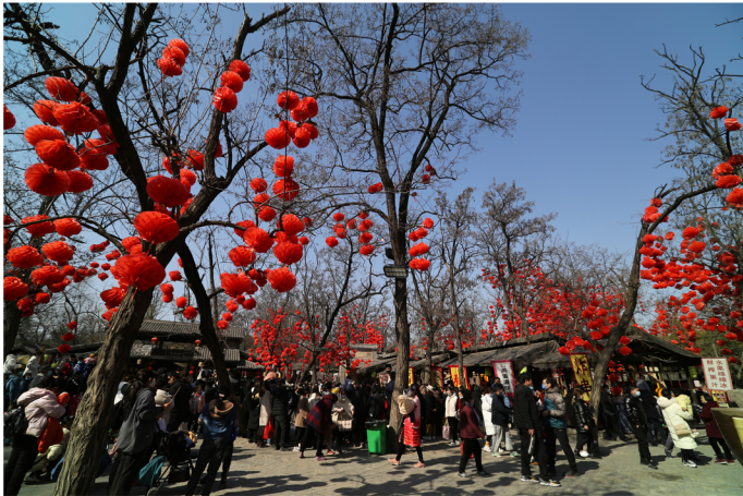
Kaifeng Temple Fair 005